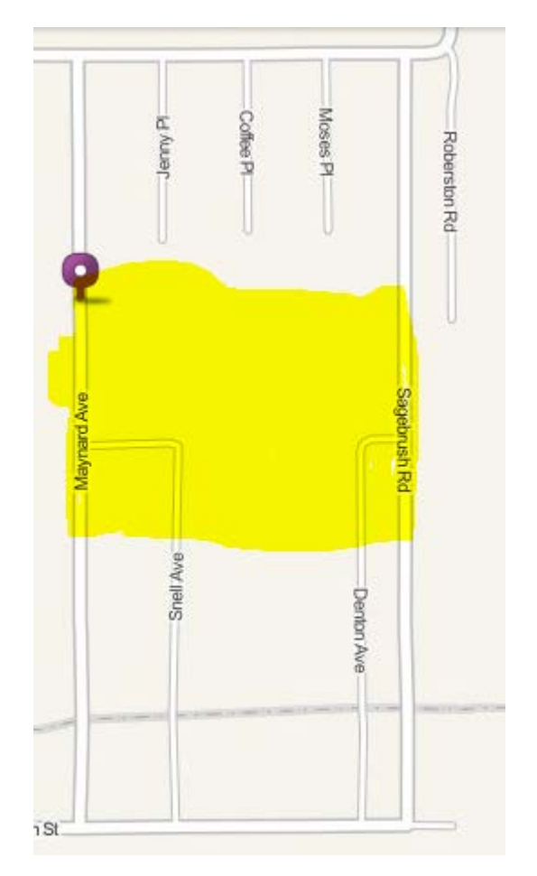
Map Details: Housing Community from 7<sup>th</sup> to 9<sup>th</sup> Streets between Maynard and Sagebrush